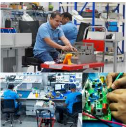
Fig 2. The facility to remanufacture

The facility will receive many different units and some of those units are similar to Fig 3 which is from sectors like Oil & Gas, Water & Energy. This facility will remanufacture more than 1,000 units a year for the Middle East.