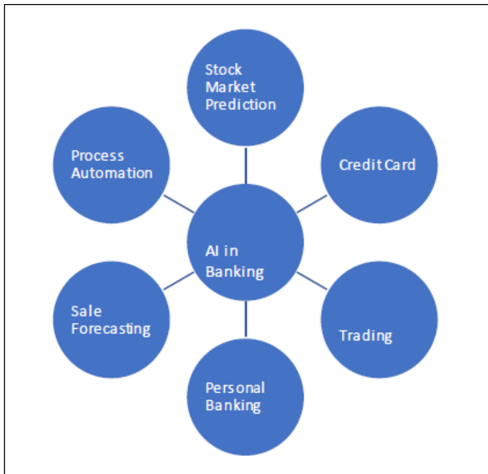
Figure 1: AI in Finance & Banking Sector

Artificial intelligence (AI) has been instrumental in automating many aspects of banking operations, from customer service to loan processing (Figure 1). AI-powered systems, such as chatbots and robotic process automation (RPA), have